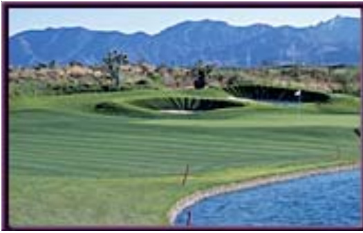
Snow Mountain Course