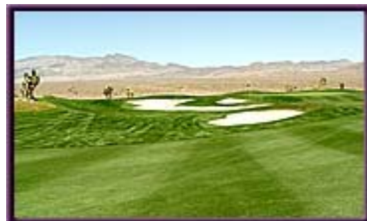
Sun Mountain Course