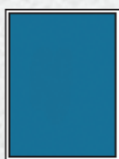
Full page no bleed 7.25 x 9.75