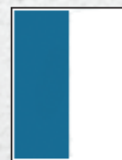
1/2 page vertical 3.5 x 9.5