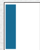
1/3 page vertical 2.25 x 9.5