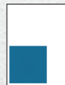
1/3 page square 4.75 x 4.625